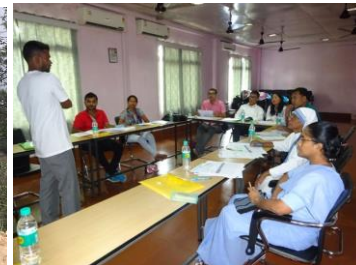
Vitamin Angles Session at NECHA