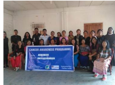
Cancer awareness to parents