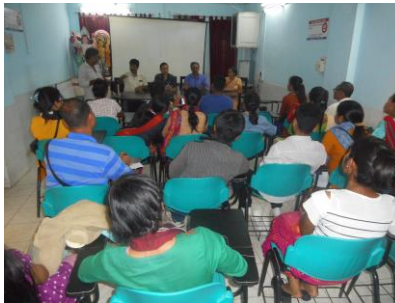
Health Awareness to rural population

Bethany Health Center established in 1986 and run by the Bethany Sisters assist patients who come for diagnosis and treatment. 1867 patients were treated while 440 school students were reached. A number of Health Camps and Health Education sessions in schools were organized. Home based medical care is given to the people through health workers, dressing of wounds, administration of Injections, IV fluids and medicines.