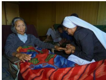
Care for the elderly