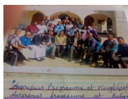
Village Awareness Class