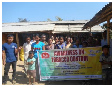
Rally against substance abuse in the village