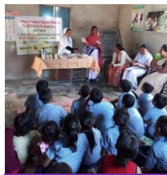
Health & Hygiene to school children