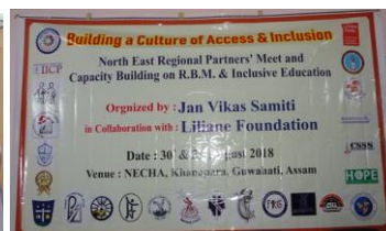
JVS Partners Meet 2018