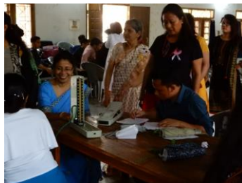
General check up of women