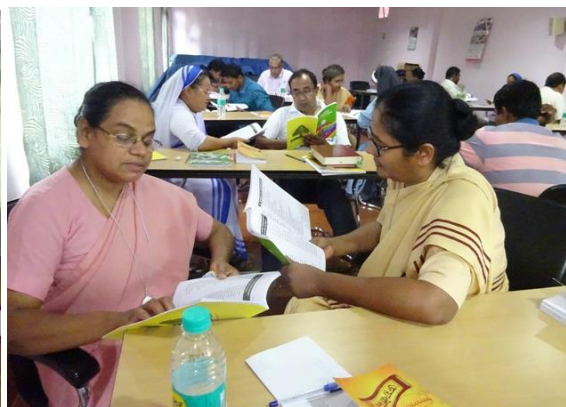
Learning in pairs