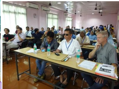
Participants JVS Meet at NECHA