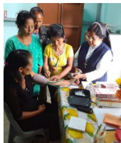
Teaching First Aid to ASHAS