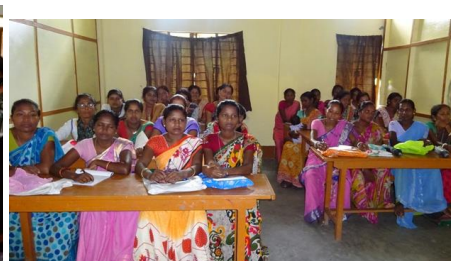
Village health leaders training