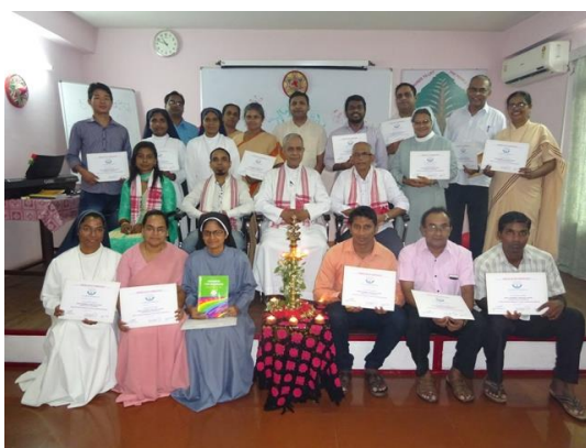
Certification, Assamese Course

The Assamese language for Beginners was organized and conducted from 9 th to 28 th July 2018 at NECHA, Sixmile, Guwahati. There were 23 students from various diocese of Assam comprising of 13 sisters, 1 brother and 9 priests. During the course the students were taught Alphabets, Conjuncts, Words, sufficient Vocabulary, Grammar and Conversational models from the text book ASSAMESE FOR BEGINNERS which was released for the purpose, in June 2018. The participants also were introduced to prayers of Holy Mass in Assamese language, recitation of Rosary, singing of hymns and reading of the Holy Bible. Although some students experienced difficulties in the initial stage, they were assisted by two teachers. They made remarkable progress in the study of the language.