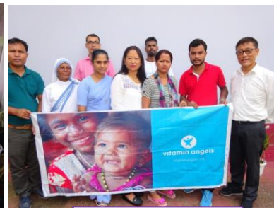
Vitamin Angles Training