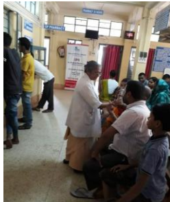
OPD patients in Holy Cross Hospital

the Government of Meghalaya have been able to reach health care to the remote areas of the state, through partnership with Catholic Organizations. It also have proved that the Government has great trust in the Catholic Health Care Ministry and it is the best way to give health care to the poor and unreached.