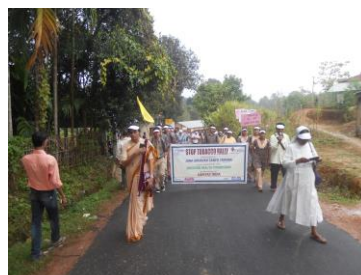
Rally against substance abuse in the city

3. National Tobacco Control Program: In collaboration with NHM, we organized 5 School awareness and 6 village awareness programs on Tobacco Control.