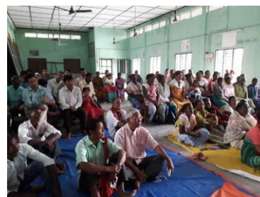
Awareness Class on Health