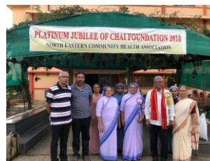
Delegates of Platinum