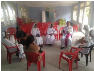
AGBM Aizawl 2018

All the MIs of ACHA are very active because of the support from the government in giving training and implementing various health programs in the district level. Cancer and substance abuse are two major health issues of Mizoram. Therefore awareness classes to parents, adolescents, school children, ASHA workers and village health monitoring units are the activities taken up by all MIs. The various parallel treatments such as acupressure, acupuncture herbal medicines, treatment using cupping and Sujok are being used by the nurse sisters in various Health Centres. MCH for others and children supplying micronutrients and vitamin A together with Albendazole are being given by every Health Centre. Mobile clinics are conducted in the rural areas and first aids is given to all patents visiting the Catholic Health Centres. Caring for the elderly in homes and immunizations of newborns and their mothers are also activities taken up the by the nurse sister and her team. The Rehabilitation centre (Peace Home) for HIV infected and affected children are being given special attention by way of animation, orientation, counseling and preparing the inmates for a self reliant future. Every year ACHA conducts AGBM, where all MIs participate whole heartedly.