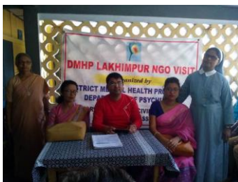
NGO visiting Harmutty