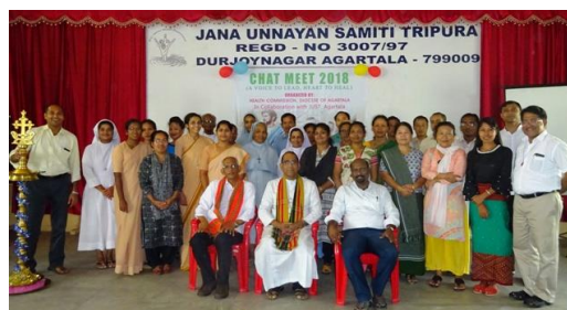
Participants of AGBM 2018