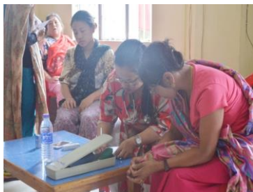
General Check up