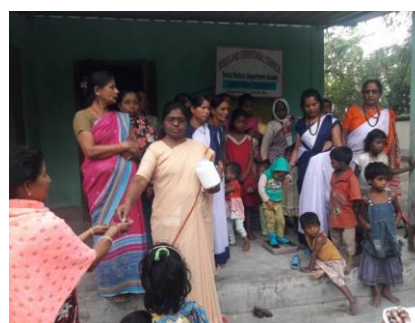
Albendazole to mothers