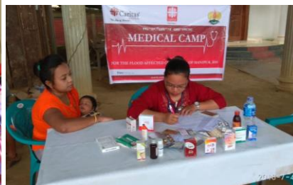
Rural Medical camp