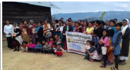
Rural awareness class & Medical camp