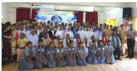
Participants Platinum Jubilee