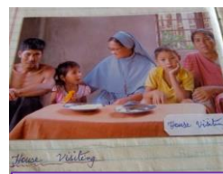
Family Health & Hygiene