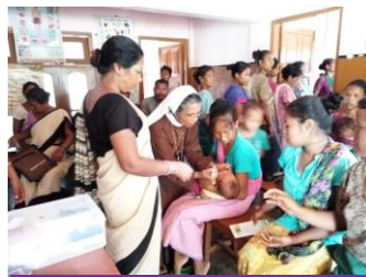
Immunization of child