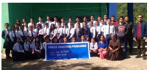
Cancer & HIV awareness to school children