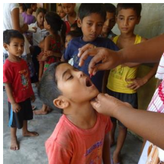
Vitamin A to children