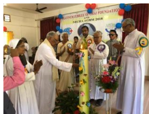
Inaugural Ceremony, Tura