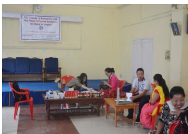
Medical Care for Flood Victims

CHAM, Manipur has 15 MIs. They had organized Health Care Promotion activities, like classes, conducted health camps and awareness sessions in the last one year. Catholic Medical Centre (CMC) is the only CHAI hospital in Manipur. It is 150 bedded, with MICU, four OTs, Cardiology equipments and facilities, Kidney dialysis, Lab. and x-ray facilities.